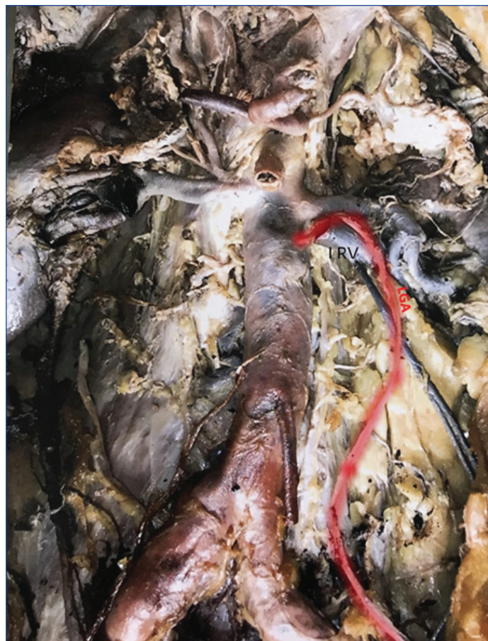
[Table/Fig-6]: Shows arching of left gonadal artery over the left renal vein. LGA: Left gonadal artery; LRV: Left renal vein

RLGA: Right lateral gonadal artery; RMGA: Right medial gonadal artery; RRA: Right renal artery; LGA: Left gonadal artery