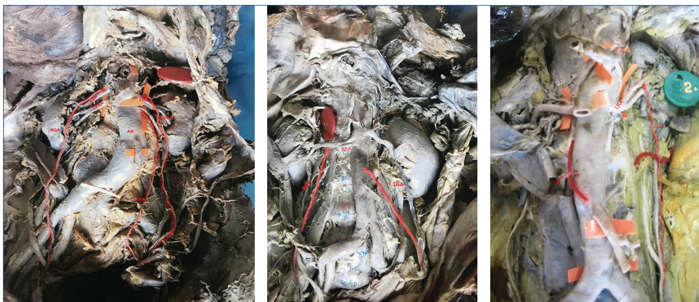
[Table/Fig-1]: Double gonadal arteries on the left side. Left upper gonadal artery arising from the left renal artery and left lower gonadal artery arising from the aorta. right gonadal artery arising from the upper right renal artery; [Table/Fig-2]: Shows right gonadal artery arising from the right renal artery and left gonadal artery from the aorta; [Table/Fig-3]: Shows left gonadal artery arising from the left renal artery. (Images from left to right) URRA: Upper right renal artery; LRRRA: Lower right renal artery; RGA: Right gonadal artery; LRA: Left renal artery; LUGA: Left upper gonadal artery; AA: Aorta; LLGA: Left lower gonadal artery; RGA: Right gonadal artery; RRA: Right renal artery; LGA: Left gonadal artery

In this study, out of 40 cases, 39 shows normal course. In all these 39 cases each artery runs obliquely downwards and posterior to the peritoneum on the psoas major muscle. Descending on the